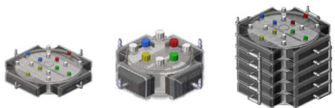
ABOVE: Consistent ratio of perfusion membranes surface area to vessel creates seamless scalability

All product contact components certified to USP Class VI and/or ISO 10093-5